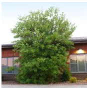
Sweet Bay Magnolia- $300.00

As trees are fragile, living things, they are planted in the spring or fall when conditions are the best.