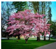
Dogwood (Stellar Pink)- $250.00