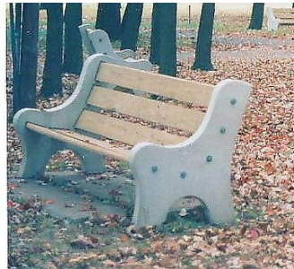
6' park bench - $450.00

When you order a commemorative bench you will discuss its location within the Lower Providence Township Parks System with the Parks & Recreation Director. Lower Providence Township must approve the wording and size on any plaques you wish to include on the bench.