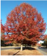
Red / White Oak - $350.00