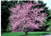
Eastern Redbud - $250.00